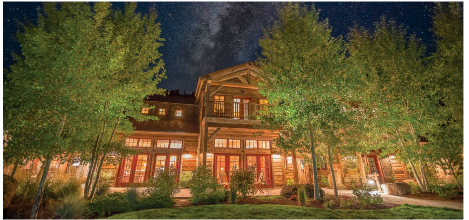
Rip Wheeler's Bourbon & Bonfire