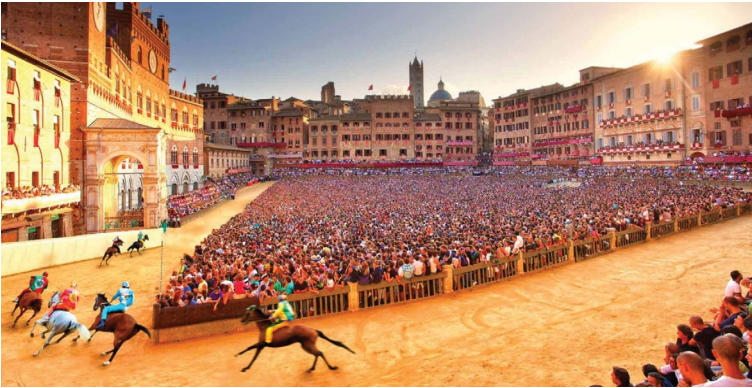
Italy's Grand Palio Tradition