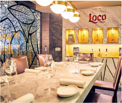
Loco Tequila: Experience Mexico City's Exceptional Spirit