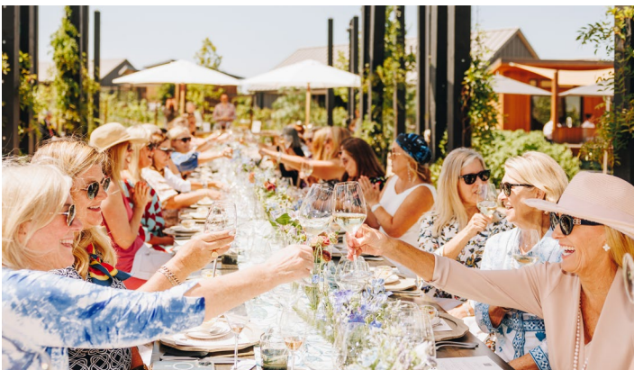
Ladies Luncheon with The Fifth Avenue Club by Saks Fifth Avenue at Stanly Ranch / Gentlemen's Dinner at Wing & Barrel Ranch