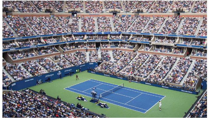
Serving Up Aces with Darioush